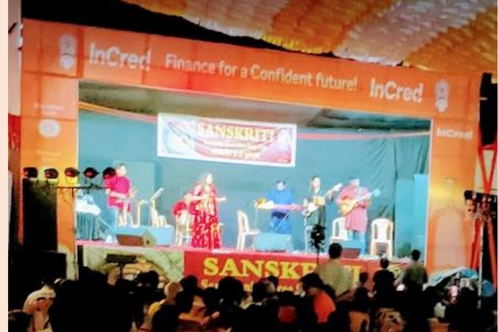
Entertainment Stage Gate