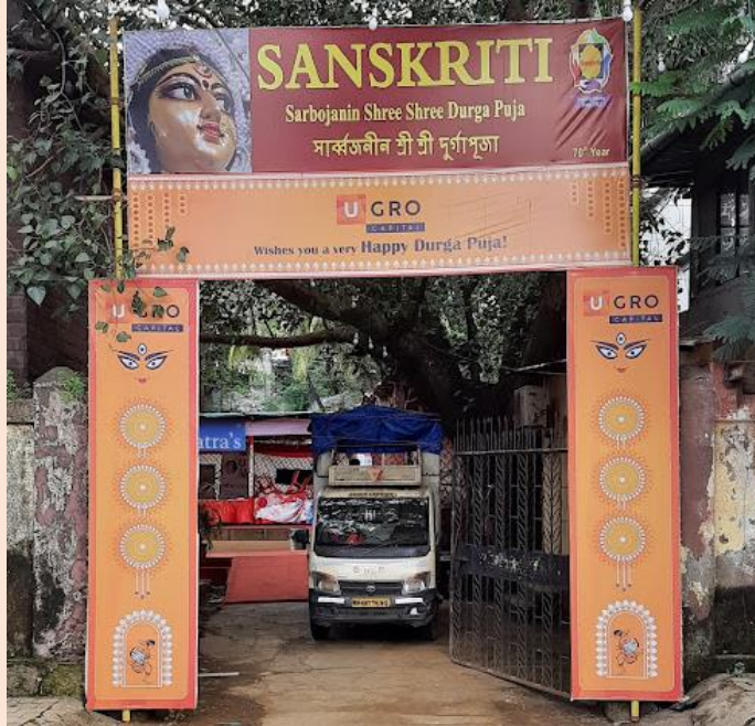
Main Entrance Gate